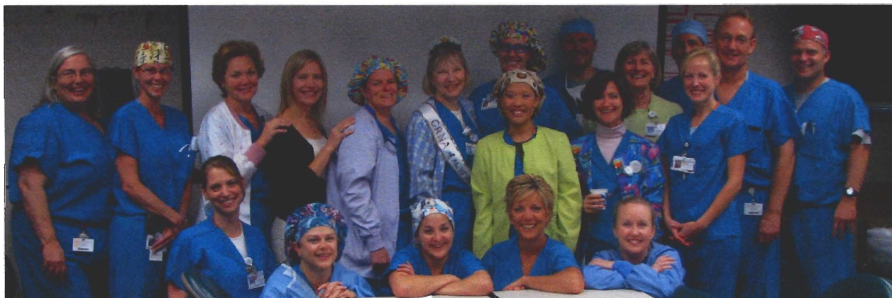
University Hospital CRNAs