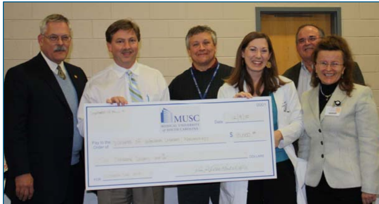
2010 Participation Winners Divisions of Infectious Disease & Rheumatology

January 19, 2012, 4:30 – 7:00 PM Harper Student Center Gymnasium